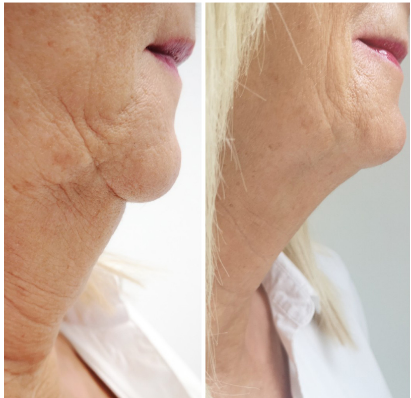
Fig. 2: Left before treatment; Right 8 weeks after treatment.

The patient was treated with the S.I.H.T System. This is technically a monopolar, controlled heating of tissue layers of different depths with high-frequency current, voltage and frequency modulation. This application can be controlled by a thermal imaging camera via a monitor platform. It is recommended to apply before treatment a local anesthetic injection in the area of the entry point of the probe of the RF. Topical anesthesia cream, nerve block or tumescent anesthesia are not necessary in such a therapy. The insertion of the probe itself is almost painless. Only the point of entry will be painful, so local